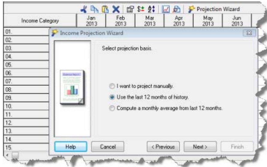
Figure 2: The QuickBooks Income Projection Wizard.

If you're projecting manually, be prepared to calculate the Cost of Goods Sold (COGS). This number contains three pieces: